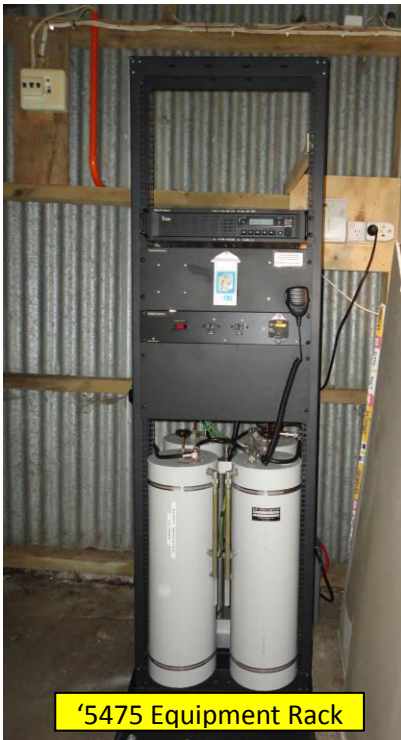
'5475 Equipment Rack

Stage 3 of the Waikato VHF Group's 2 metre repeater "WaiPlenty network" was completed on Saturday 22 November when "Waihi North '5475" was commissioned. This new repeater, sited 8km east-north-east of Waihi, offers east coast coverage from north of Whangamata to south of Katikati plus the Karangahake and Athenree Gorges. Funded by a generous donation from NZART Branch 43, their members now enjoy hand-held coverage throughout the Waihi area.